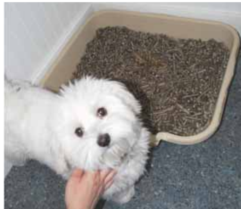
Belle is litter-trained. Her litter box is bigger than a typical cat litter-box and the litter itself is different.

"(Coton de Tulear's) are believed to have originated on the island of Madagascar more than three centuries ago. They are members of the Bichon family (Bichon Frise, Havanese, Lowchen, Bolognese, and Maltese) and believed to have mixed with the island's terriers and Papillons. Cotons are born with either pink or black skin. They come in two base colors with those being either black or white. Accents include white, tri color, yellow or grey. Although their coats tend to turn lighter in color as they age, pigmentation in a puppy with color is superior to one born white."